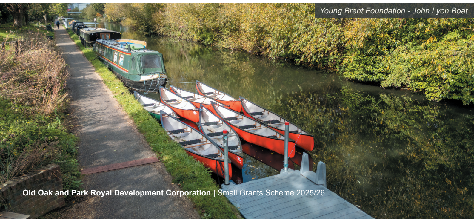
Young Brent Foundation - John Lyon Boat