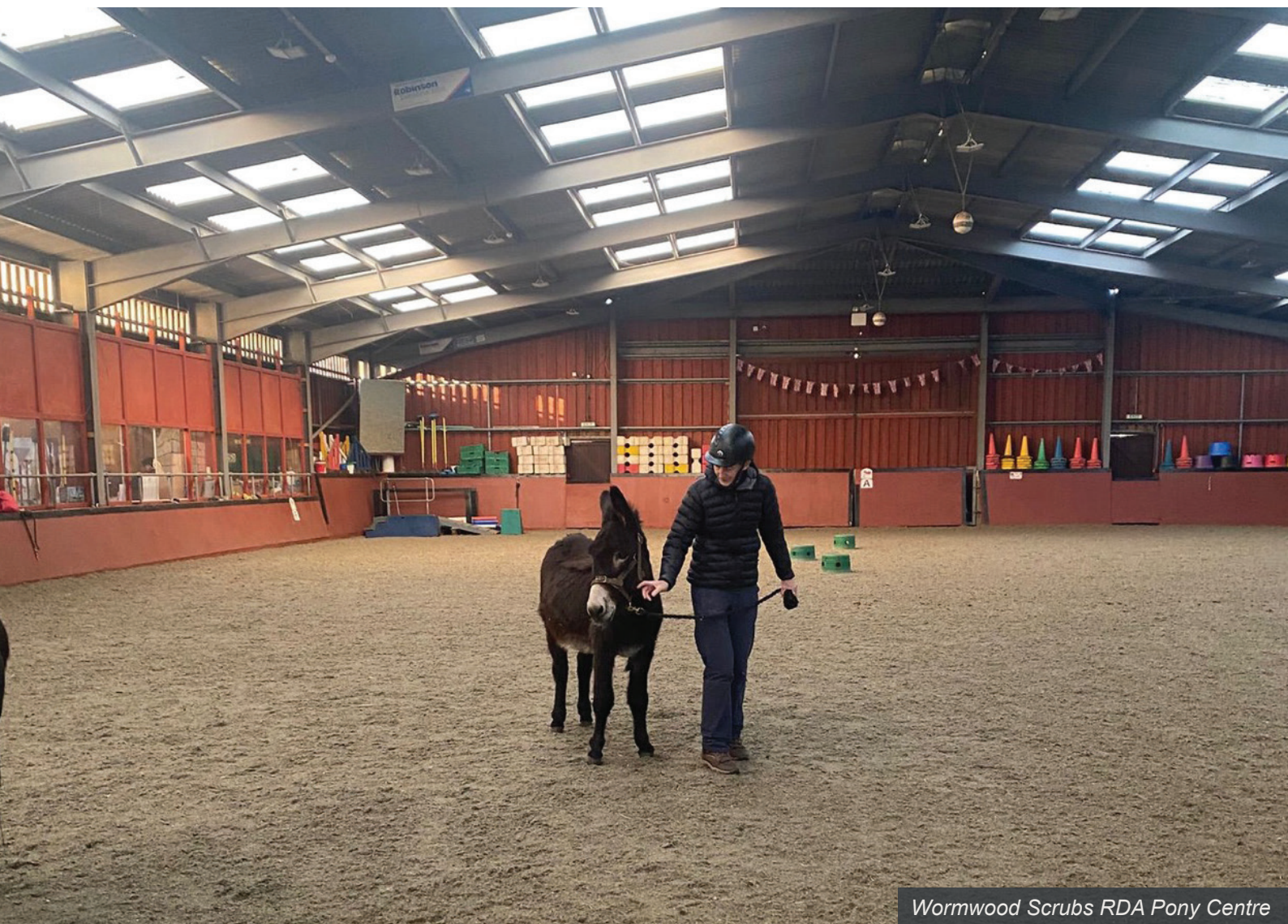
Wormwood Scrubs RDA Pony Centre