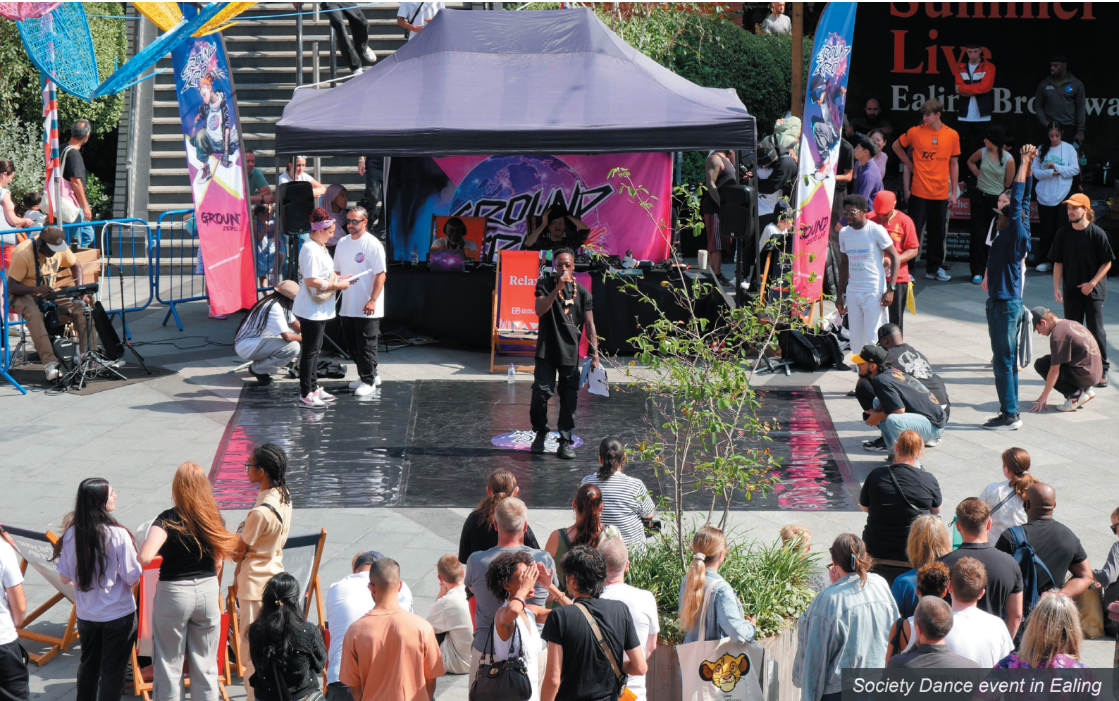
Society Dance event in Ealing